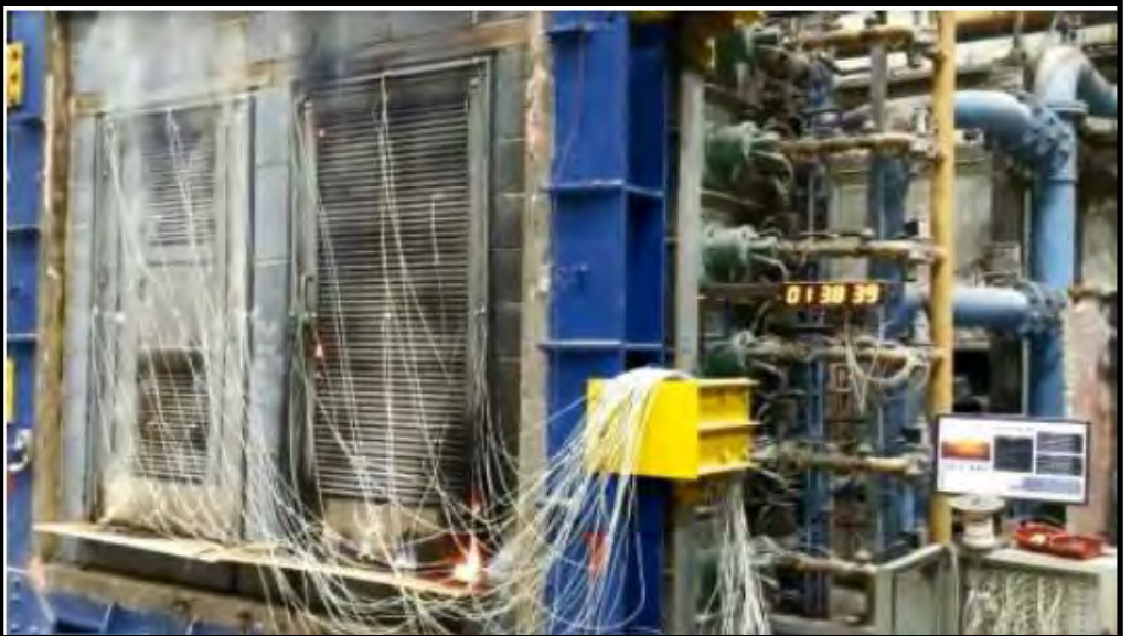
Premier's louvres have been fire-tested by the BRE (British Research Establishment)